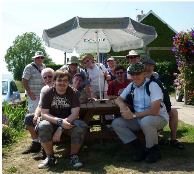
Men's Walk - Pulborough to Amberley and back again 26th June 2010

I would like us to run this 10 week course from September. Could you invite someone? Please be in prayer.